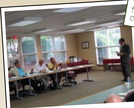
Members of the Energy Task Force, Tennessee House of Representative Republican Caucus visited Oak Ridge in August.