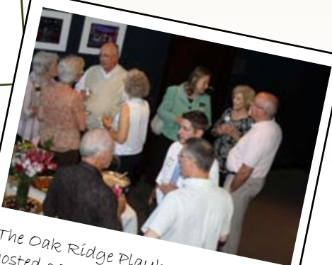
The Oak Ridge Playhouse hosted a Business After Hours at the newly-renovated theater in August.