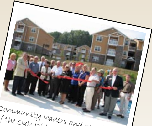
Community leaders and members of the Oak Ridge Chamber of Commerce gathered to cut the ribbon for Centennial village, Oak Ridge's newest apartment complex.