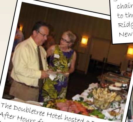
The Doubletree Hotel hosted a Business After Hours for Chamber members in August.