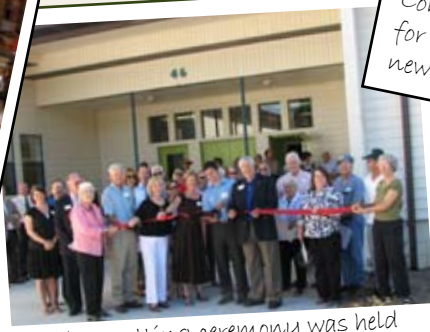
A ribbon cutting ceremony was held at the Oak Ridge Children's Museum to celebrate their new parking lot and signage.