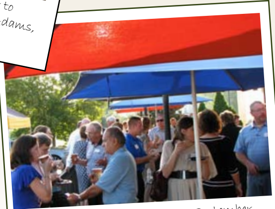
Panera Bread had a gorgeous September morning for their recent Business & Breakfast.