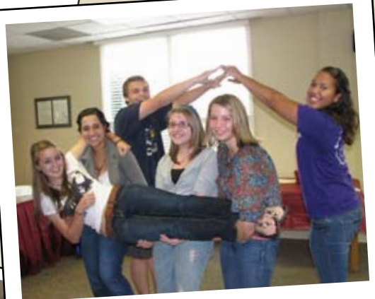
Members of newly-formed Youth Leadership class participate in a team-building activity at their first meeting.