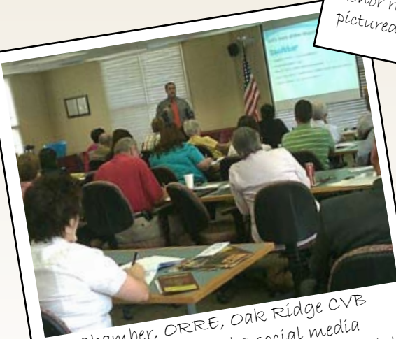
The Chamber, ORRE, Oak Ridge CVB and TSBDC presented a social media seminar in September. Specialized social media seminars will be announced soon.