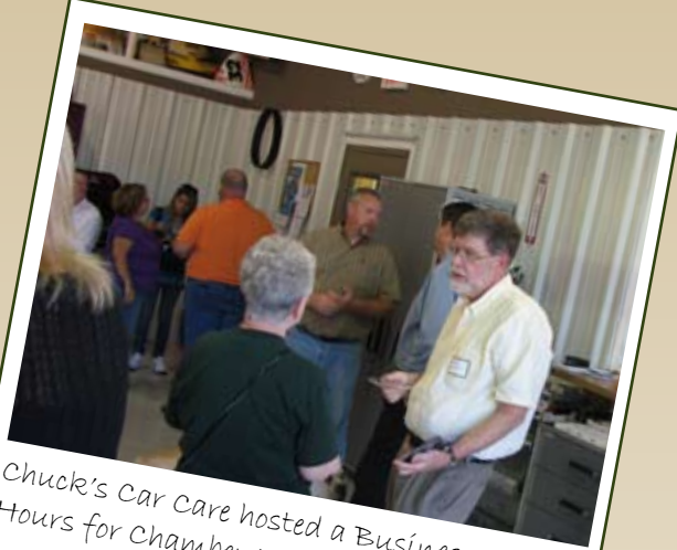
Chuck's Car Care hosted a Business After Hours for Chamber Members in September.