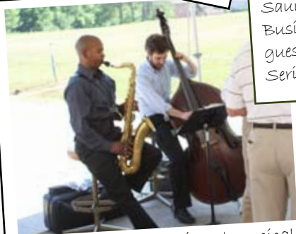
Chamber members enjoyed musical entertainment at a Business After Hours at Westgate in June.