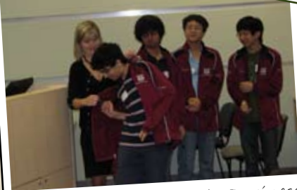
Fluor Technologies hosted a Business & Breakfast at Oak Ridge High School. As part of the event, four ORHS science students and their teacher were honored for winning DOE's Tennessee Science Bowl.