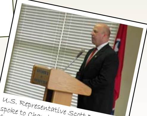
U.S. Representative Scott DesJarlais spoke to Chamber members at a forum in May.