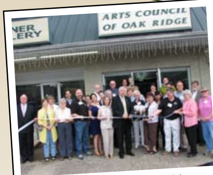
The Arts Council of Oak Ridge celebrated a ribbon cutting at their new location in the Grove Center in April.