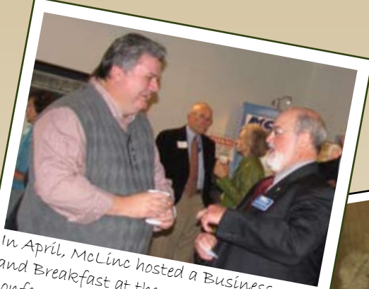
In April, McLinc hosted a Business and Breakfast at the newly-renovated conference center at Horizon Center.