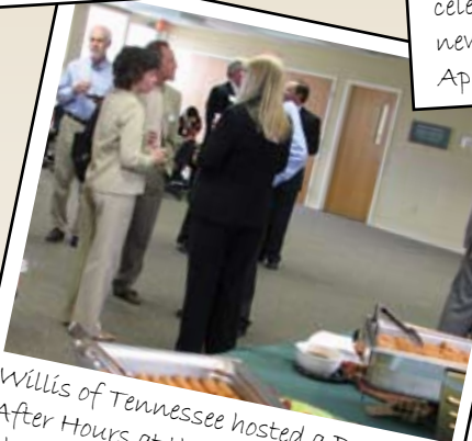
Willis of Tennessee hosted a Business After Hours at the Oak Ridge Chamber of Commerce in March.