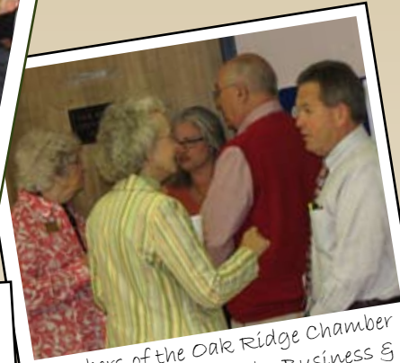
Members of the Oak Ridge Chamber of Commerce attended a Business & Breakfast at Ridgeview in May.