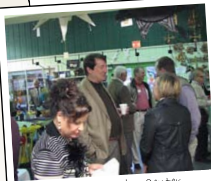
Willow Ridge Garden Center kicked off the holiday season with a Business & Breakfast in November.