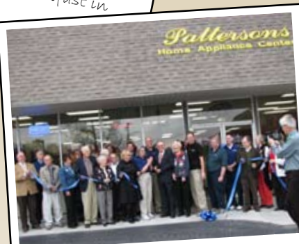
Patterson's Home Appliance Center hosted a ribbon cutting in December at their new location on the Oak Ridge Turnpike.