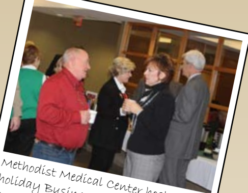
Methodist Medical Center hosted a holiday Business & Breakfast in December.