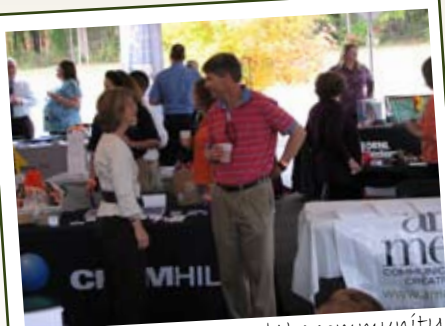
Chamber members and the community came out to participate in the Chamber's first-ever PRIMETIME networking event. This one had a tailgating theme.