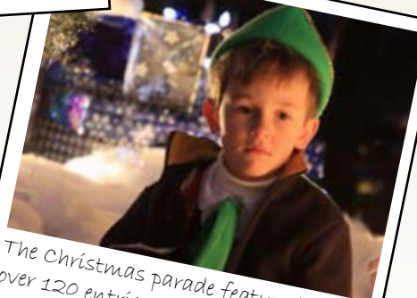
The Christmas parade featured over 120 entries this year. Perfect weather helped bring out some of the largest crowds of spectators in recent memory.