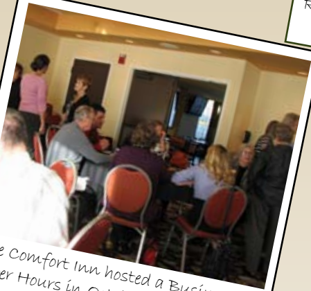
The Comfort Inn hosted a Business After Hours in October.