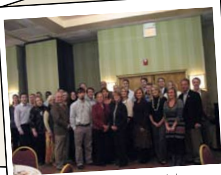
The Leadership Oak Ridge class of 2011 graduated in November.