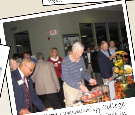
Roane State Community College hosted a Business & Breakfast in November.